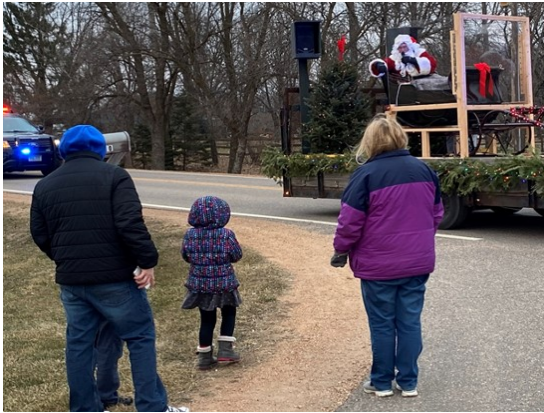
Santa Claus on his sleigh bringing joy and collecting food shelf donations.

Saturday December 19, 2020, the West Hennepin Public Safety (WHPS) Volunteer Reserve Officers hosted the popular event “View Santa” in Maple Plain and Independence. They have been hosting this event for 40 years.